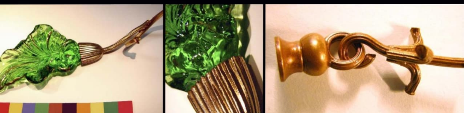
4. State after lacquering