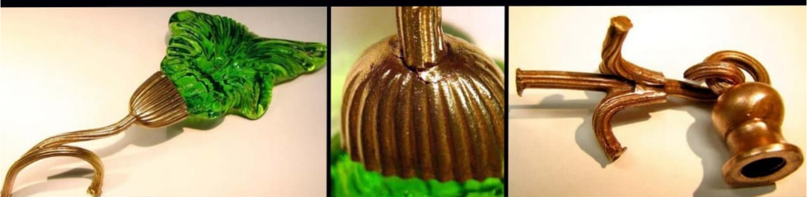
3. State after chemical cleaning