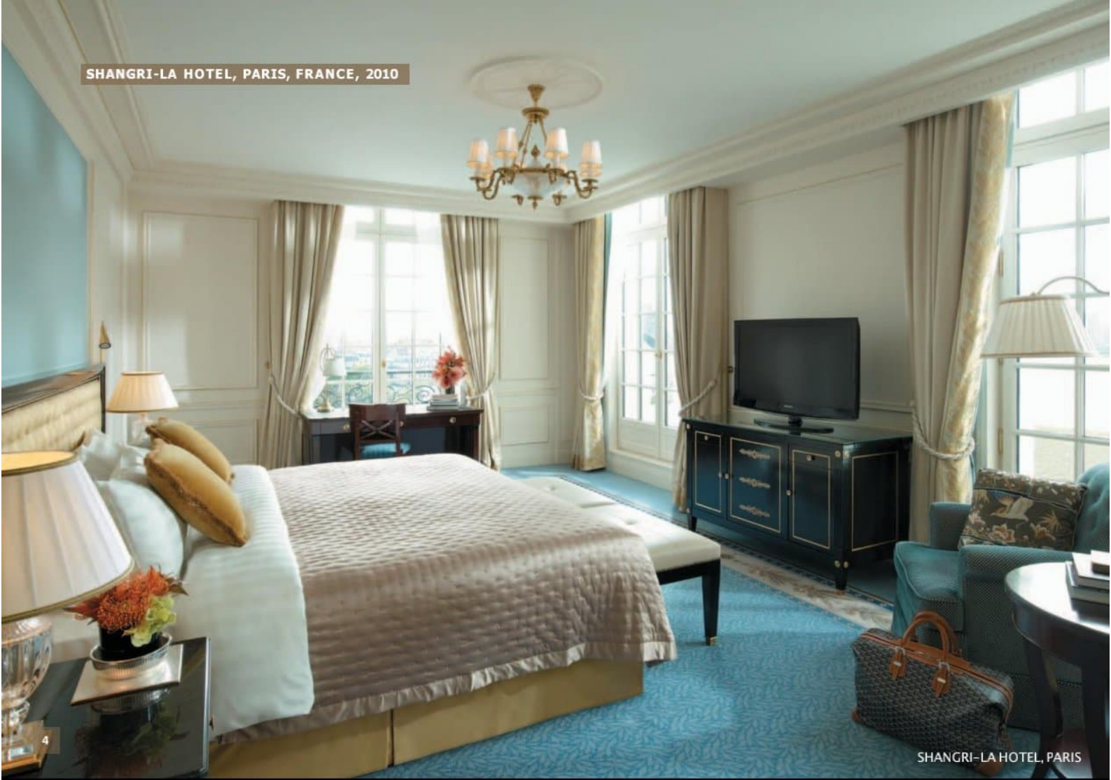
SHANGRI-LA HOTEL, PARIS