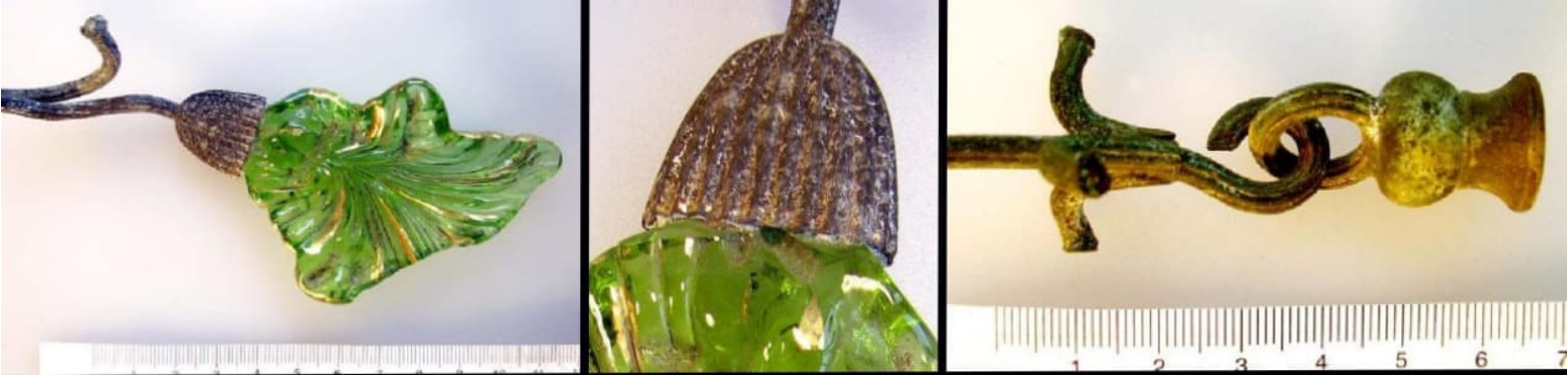
1. Original state