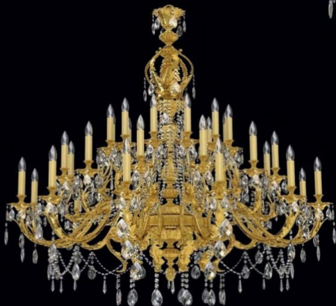
63 049 945 036-01 Ø 150 CM / 59 IN ↑150 CM / 59 IN • See more technical details on page 53