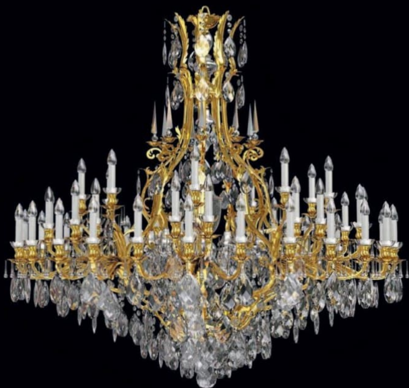
61 041 215 065-42 Ø 180 CM / 71 IN ↑170 CM / 67 IN • See more technical details on page 53