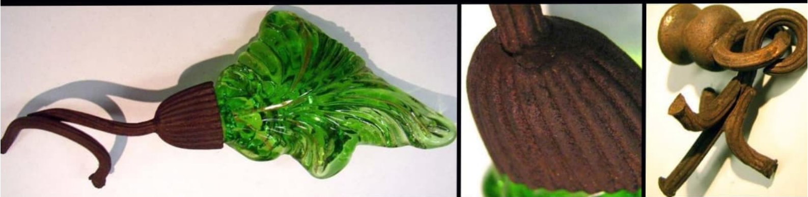
2. State after plasma reduction