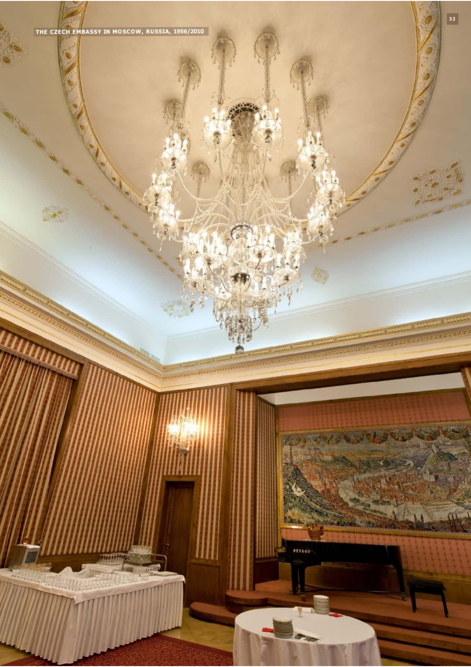
THE CZECH EMBASSY IN MOSCOW, RUSSIA, 1956/2010